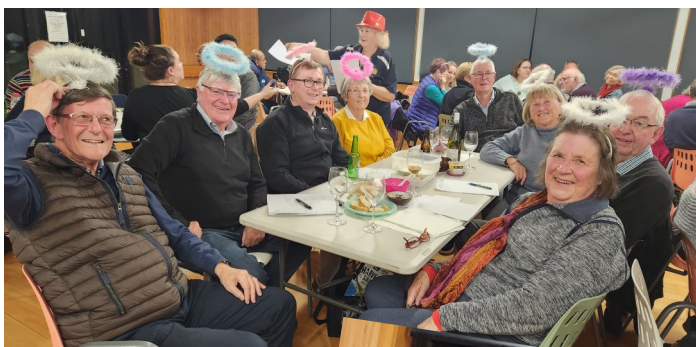
Milford's 'Fallen Angels'

Milford won the quiz by a whisker, after a run-off with Devonport.