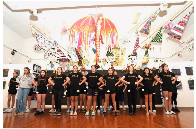
Spotted at the Matariki launch at the Mairangi Arts Centre